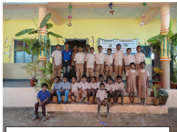
“Children team at orphanage building”