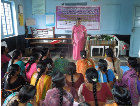
"Demonstration trng on herbal medicine"