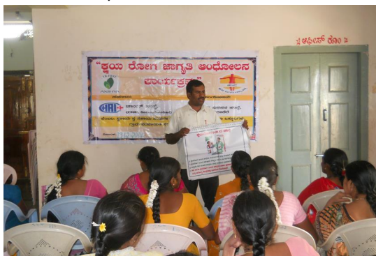
“Awareness on TB disease control”

VIKASANA moved forward the flow of campaign to generate awareness on Tuberculosis and RNTCP, to reinforce the messages on TB and addresses misconceptions identified among village circles. GKS village meetings, strengthening of referral services, sputum testing and hand bills promotions were the key component initiated in more than 95 villages which are considered as poor performance area. With the support of CHAI, Secunderabad and coordination of district coordination have enabled successful implementation of the intervention.