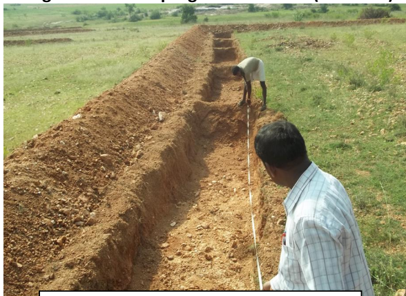
"Formation of earthen bunds"