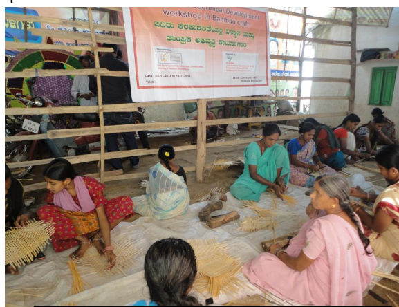
“Bamboo Artisans at work”