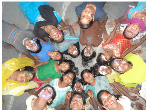
“Face painting day”

In order to provide support to 16 old girl children from 14 backward villages who received help to ensure regular attendance in formal school staying in Galihalli centre which is one more bridge school attached to chattanahalli HRD centre. Here a family environment experienced by all the children and they all passed to next standards. It was made more meaningful through an access to learning assistance, education materials, nutritious food, recreational activities, practice of improved systems and quality in all implementation initiatives concluded with children overall development.