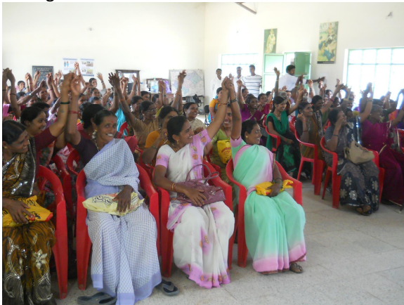
“Making rural women empower”

VIKASANA given a priority on maximum women participation in periodic trainings/awareness generation programmes on different topics connected to women such as self help concept, leadership qualities, gender development, women rights and empowerment. We strived hard to strengthen the voice of women who belongs to SC, ST and Minorities, neglected, marginalized and victim of domestic violence. In this year, 08 Gender workshops, 12 SUGRAMA federation meetings, and 04 Legal Aid services received by women community in 09 working blocks. As a result women are strong in the society, collectively bargained at the fair price shop, anganawadi food, mid day meals and community action for better reforms at the village level. 04 Illegal alcohol selling shops were closed during the year. Women were made aware of the various Government programmes like; SGSY, small savings and women rights and reservations, and credit management.