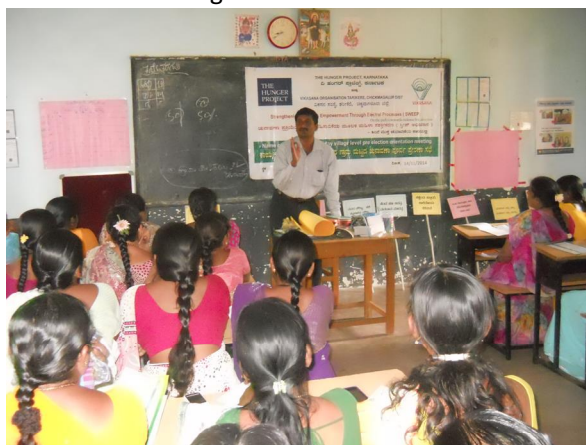
“Women capacity building program”

With a view to strengthen the capacities and leadership abilities of Elected women representatives, VIKASANA implemented the project “Strengthening Elected Women Representative Federations” in 09 working blocks of 4 districts in Karnataka state with the support of The Hunger Project, Bangalore. The series of workshop, trainings and short meetings called and strengthened the voice of elected women representative in the radius of 129 Grampanchayaths from 09 working blocks of Chikmagalur, Shimoga, Hassan and Davangere districts.