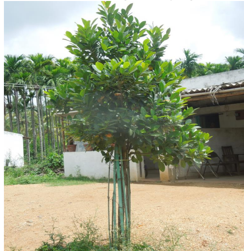
"Care and protection of plants"