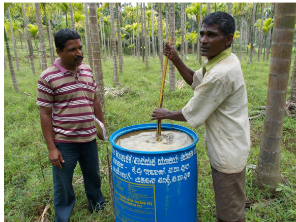
“Preparation of Jeevamrutha”

With the success of Organic Village/Site Programme, the department of agriculture has been decided and extended the implementation of Savaya Bhagya Yojane at Hobli level by VIKASANA in Gubbiga village of N.R.Taluk and Muguli, Anuvanahalli, K.Gollarahalli, Kesarukoppa and Chikkathuru/Yalugere village of Tarikere taluk of Chikmagalur district. 618 Backward families fallen under 600 Ha of land chosen for the implementation of Savayava Bhagya Yojane. Awareness generation, training and capacity building, promotion of vermin compost, pest and disease management, crop management, livelihood security and organic certifications are the main activities transformed the villages.