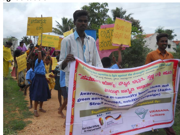
“Jatha for community health”

VIKASANA implemented "Enhancing local capacities to fight against the drought situation in 20 villages of Kadur block, Chikmagalore district" with the financial support from Karl Kubel Stiftung (KKS), Germany and BMZ, Germany. This intervention is contributing in reduction of economical stress and improves living standards of 1598 low income families. Formation and strengthening of SHGs, VDCs and WDCs are in place. Besides training and capacity building programmes helped to reach the concept among the target group. Activities related to organic farming and watershed treatments have been started with the people cooperation that will later effects on improve the agriculture production and soil conservation. The programme is also concentrated on livelihood employment generation programmes, alternative energy sources, health and sanitation together followed by awareness generation and training programmes. By