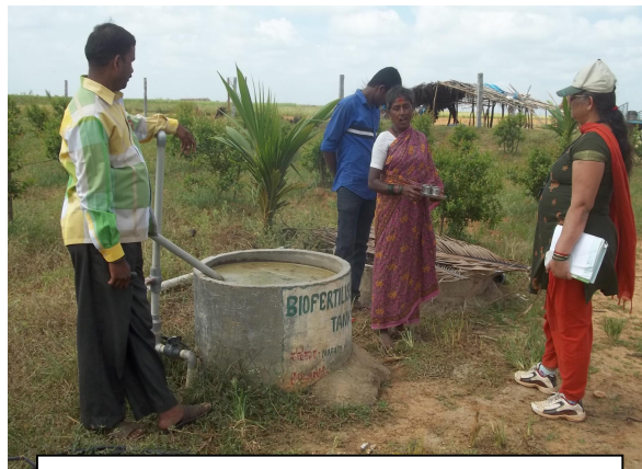
"Production of bio-fertilizers for crops"

VIKASANA implemented the Full implementation phase in Begur village with the support of NABARD Bangalore. This project helped farmers to experience the sustainable benefits in dry land followed by management of water and soil for improved yield productivity, the project implemented in Begur, Muguli, Gadihalli, Mylanahalli and Guddadahalli village of Tarikere taluk that benefited to 370 families. The activities such as capacity building training, exposures, sharing experience, motivation meetings, placement