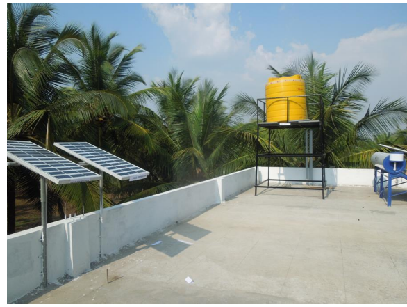
“Supported by SMILE FOUNDATION”