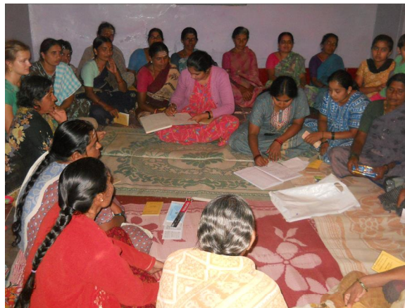
“Interaction at SHG meetings”