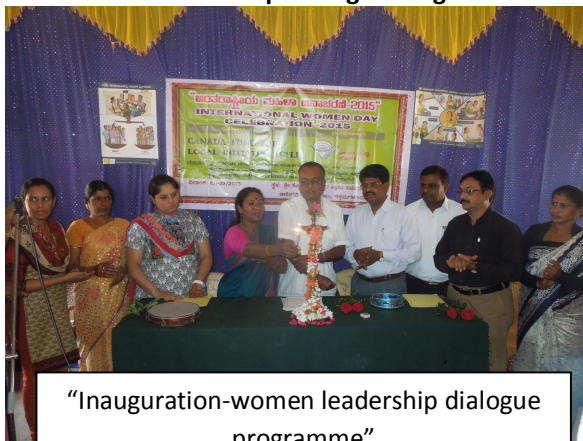
“Inauguration-women leadership dialogue programme”