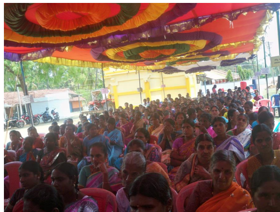
“Women’s participation in all programs”