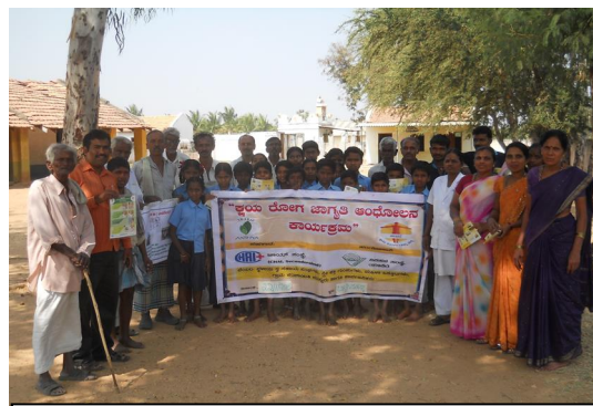
“Community sensitization on TB”