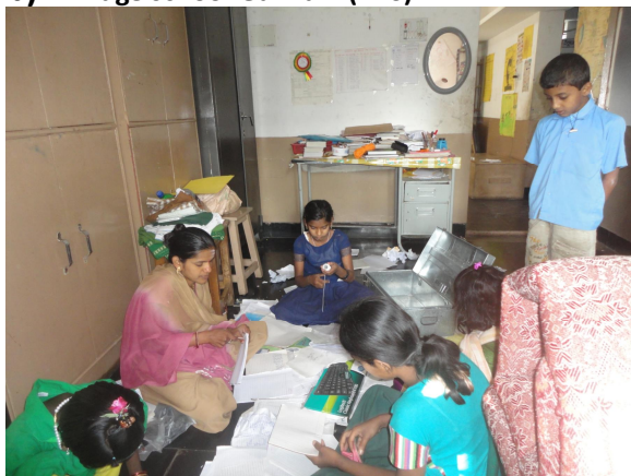
“Learning with team”