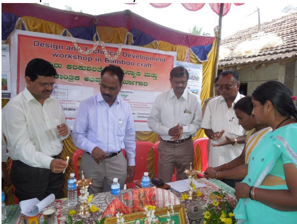
“Inauguration of Design workshop”

In order to ensure promotion and development of disappearing traditional handicrafts in rural villages aiming at the benefit of needy artisans community; VIKASANA is implementing a AHVV and Non AHVV Schemes in Chikmagalur district, Karnataka with the grant support from office of development commissioner (Handicrafts), Mangalore . Formation of 14 artisans groups, baseline study of 229 artisan’s families, 02 design and technical development workshop for 30+30 artisans, large group discussion, development of identity cards for 90 artisans were completed so far.