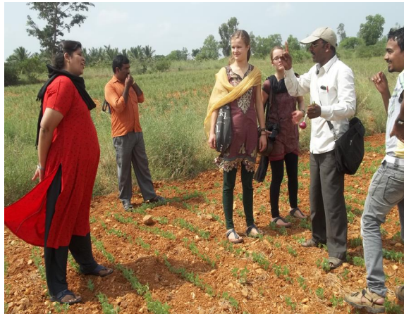
“Filed visit by BBP volunteers-Germany”