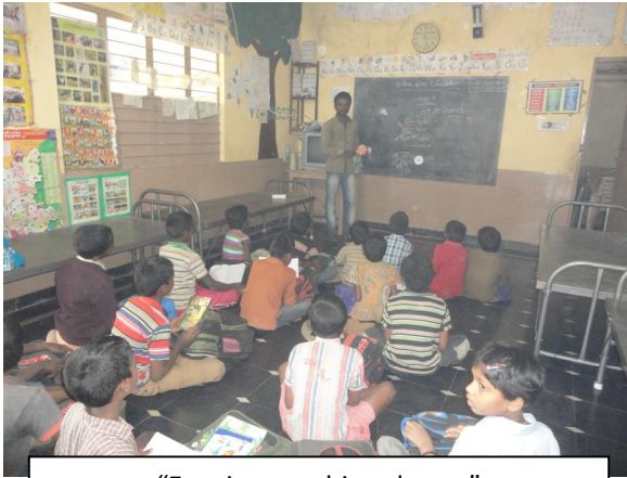
“Evening coaching classes”