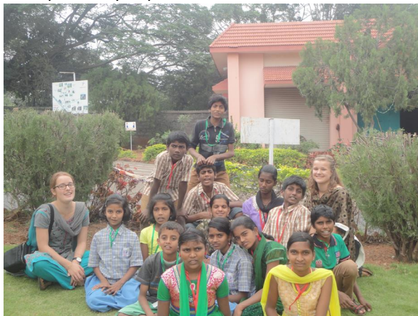
“Children with BBP Volunteers-Germany”

develop social network sites, documentation programme reports were undertaken effectively which have been positively impacted on children as well as volunteers.