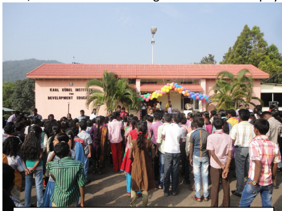
“Karl Kubel Trophy at KKID, Coimbatore”

KKID, Coimbatore has arranged Karal Kubel Trophy