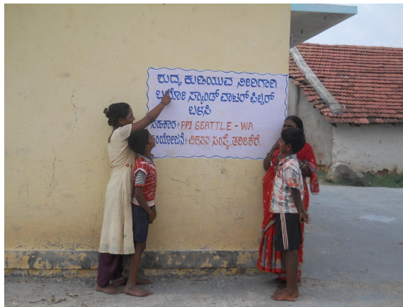
“Wall writings on bio-sand water filter”

Bio-sand water filters project is implementing by VIKASANA in 03 villages of Kalkere Gram panchayath, Kadur block, Chikmagalur district, with an overall objective of easy access to safe and sustainable drinking water through a new concept. A financial assistance and technical guidance supported by People for progress in India, Seattle, WA. 151 Beneficiaries happily drink the bio-sand filtered water that made reduction of waterborne diseases. It was also ensured continuous availability of safe purified bio-sand water for better living condition of these rural lives.