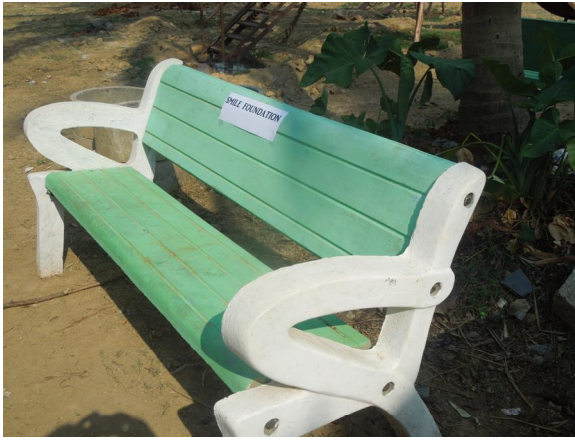
“Sitting chair in the playground”