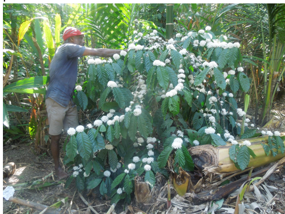
“Flowering coffee plants”

VIKASANA continued implementation of “Integrated Tribal development programme” in Koppa and Shirngeir block since May 2011, with a view to ensure sustainable economic improvement of tribal communities. NABARD Bangalore is provided financial assistance to reach the development services to 498 Tribal families. All these families cooperated actively with the project activities and sustained at the possible extent.