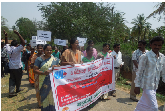
“World TB day celebration”

World Tuberculosis Day, falling on March 24 each