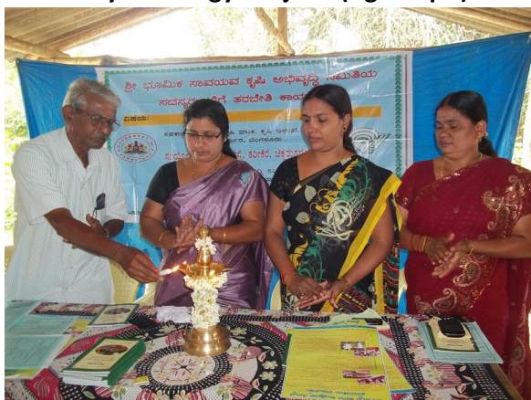
“Inauguration of Savayava Bhagya Yojane”