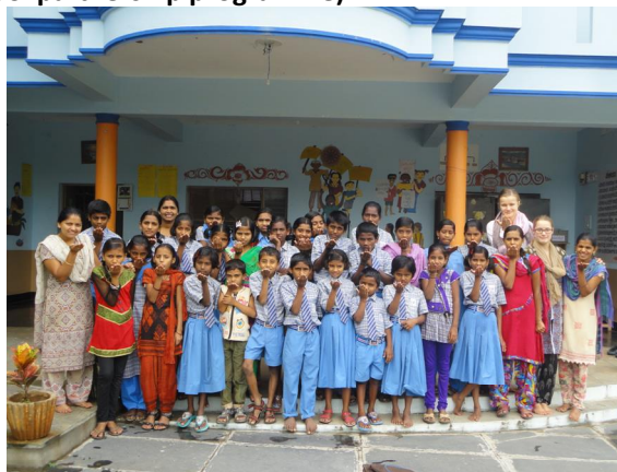
"Chattanahalli children team"

There are 19 children from 16 backward villages have been supported for their education continuation through rehabilitation with the support of Anna Schmidt School, Frankfurt through KKS, Germany . The primary objective of this program means to develop inter cultural exchanges, sharing of ideas, interactions