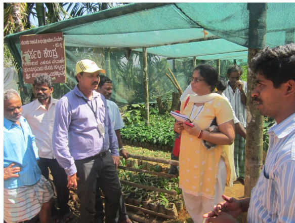
“Monitoring Visit by DDM-NABARD”