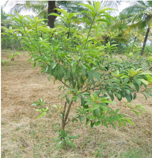
"Tree plantation for green environment"

VIKASANA working in 03 villages of Duglapura cluster with the support of PPI, Seattle, WA, with the concrete aim of reduce the generation of CARBON EMISSION through action of promoting tree plantation, 658 Rural poor in project villages have understood the importance of environment protection and contributed their cooperation in successful implementation and monitoring of this programme.