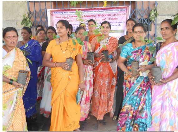
"Distribution of herbal medicine plants"