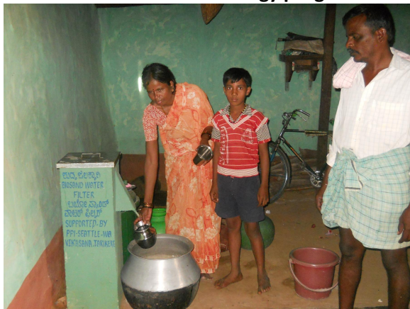
“Improved access to safe water”