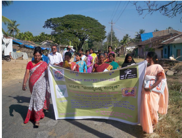
"Jatha for bio-diversity conservation"

As like every year, our application for National Environment Awareness Campaign considered and approved by Karnataka Vignyana Parishat, Bangalore. The programme implemented in Station Duglapura village of Tarikere block, Chikmaglaur district. The primary objective of this programme was to promote bio-diversity conservation followed by awareness and action component. Awareness has been successfully generated among 154 beneficiaries of Duglapura village. As a result, people promised to practicing systems towards managing forest, environment protection, planting trees and conserve medicinal plants. School teachers and children have come forwarded for environment protection. 100 different plants (silver, teak, honge and neem) have been planted. Besides a follow up taken towards sustain of plantations there by reminding community about need of bio-diversity conservation.