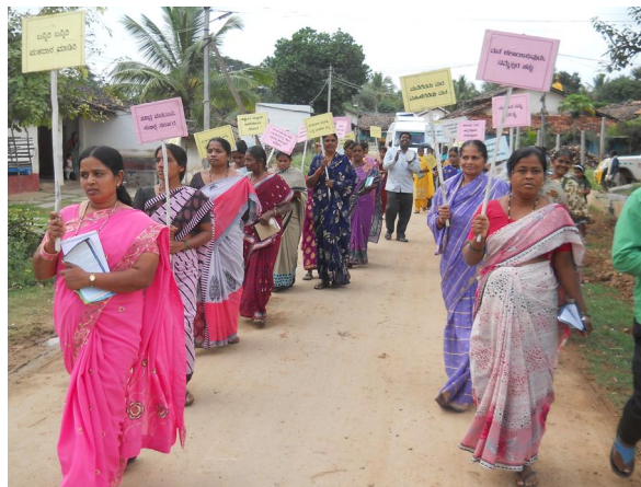
“Awareness Jatha Campaign”