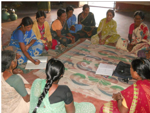
“Self Help Group Meetings”

thrift regularly and use the thrift to make small interest bearing loans to members, and in the process learn the nuances of financial discipline. Credits made people to receive additional money from adopted income generating programmes like Dairy, Goat /Sheep rearing, starting of self employment and even for family needs like marriages, and festival celebrations. Several groups were registered and obtained financial assistance from the Banks and Government institutions with the cooperation of NABARD, Lead Bank, Sanga mitra finance and Local Banks. Initiatives invited to make these groups as permanent existence in project villages for further development, sustainability of the project activities and collective action.