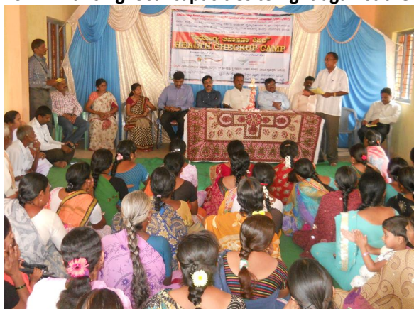
“Training on drought relief measures”