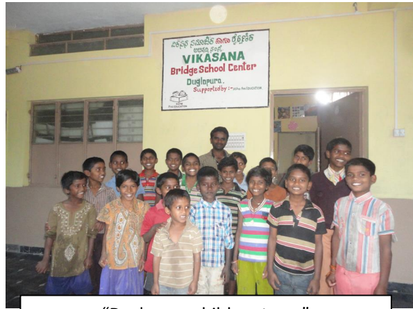
“Duglapura children team”

Another children rehabilitation bridge school is running by VIKASANA in Duglapura village which is 13km distance from Tarikere block with the support by ASHA for Education, Seattle. It was given importance to nurture systematic daily routine, progressive activities, systems and qualities in implementation of relevant measures aiming at overall well being of 20 children studying in this centre.